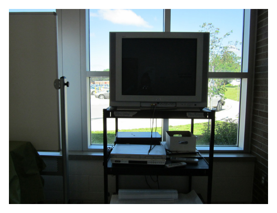
FIGURE 32. Television

Interestingly, while the importance of technology was highlighted, the use of science and sports equipment, as well as musical instruments was also seen to foster this sense of discovery. For example, Music Instruments (Figure 26) focused on "learning new techniques and new notes on all of our instruments," while a picture of the door to the music room suggested it was a space that "helps us learn by making our own rhythms with instruments and exploring new things." Of course, the use of these tools to foster discovery also comes with questions of access, time spent, and priorities in education. As Music Instruments (Figure 26) illustrates, this school had access to a wide range of instruments, something not all schools are afforded, either due to lack of resources or cutbacks that affect music programs. Yet, the students' engagement and desire to learn music was evident through their comments. They viewed tools such as instruments as central to their engagement as learners. In a beautiful photograph of piano keys, one group concluded: "We are engaged in the arts which is represented by the piano keys" (Piano Keys, Figure 33).