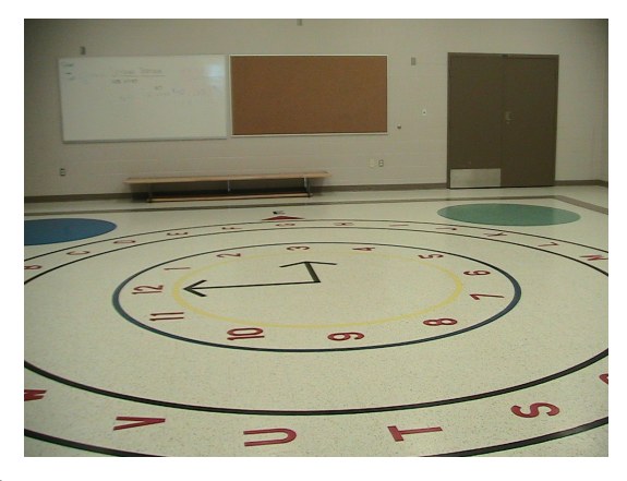
FIGURE 6. Gym

Though perhaps seemingly in contrast, spaces that allowed for quiet focus and independence were also represented by Library (Figure 7) and Hallway (NI). These photographs suggest that active does not necessarily denote outward physical movements but rather, an active thinking that can be reflected through reading and independent work as well. The photographers for Library (Figure 7), for example, explained: "We chose the library because it's [a] quiet environment, allowing us to think and concentrate while we are reading." On a related vein, Hallway (NI) was chosen to represent a workspace "because when everyone is in class, the hallway is quiet, which allows us to be independent, so that we can focus on our work." Regardless of the space, interest and active involvement take on similar understandings in this theme.