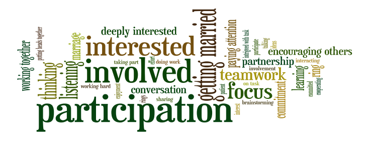
FIGURE 1. "Engagement is...." brainstorming Wordle

Definitions of engagement began with a group brainstorming activity in response to the question, "What does engagement mean to you?" As time allowed, groups also added examples on sticky notes to support their initial brainstorming ideas. Compiling all of their responses in the below Wordle (Figure 1), the most repeated words included "participation," "involved," "interested," "getting married," "focus," "teamwork," "thinking," and "listening."