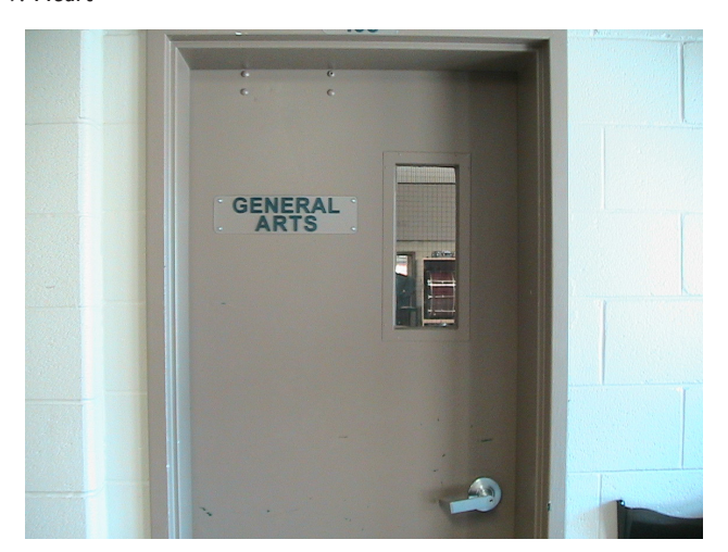
FIGURE 10. Music room

With Anti-Bully Commitment (NI) and Pledge (Figure 11), working together took on a larger purpose, reflecting teamwork and commitment to make a difference and strengthen school community. Explaining their rationale for Anti-Bully Commitment (NI), a visual of a large hand individually signed by the class, one group of students explained: "This picture represents how people work together and all agree under one thing (topic) this shows teamwork and commitment." Similarly, the description for Pledge (Figure 11) emphasized, "It engages everyone to stand up to bullying and make a difference in the school community. By doing this they can put an end to bullying."