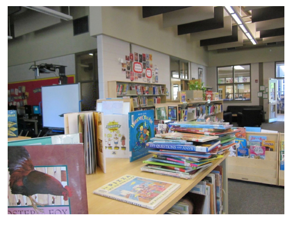
FIGURE 2. The library

When students are interested in what they are learning about they are typically very engaged in it. (The Library, Figure 2)