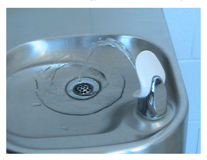
FIGURE 20. Water fountain

Nourishment. While only represented by 2 photographs, great insight is offered here as to what students require physically to engage in learning. Building on the description for Granola Bar (Figure 19), the description for Water Fountain (Figure 20) reads: "It keeps you aware, hydrated, focused, and flushes unnecessary wastes from your body." While we may perhaps smirk at this description given by a Grade 8 student, key questions are raised surrounding expectations placed on learners. We can see that this group of students, unlike other groups, focused on physical needs as necessary to engagement based on the idea of being able to focus, maintain energy, and lead to "a better day" overall.