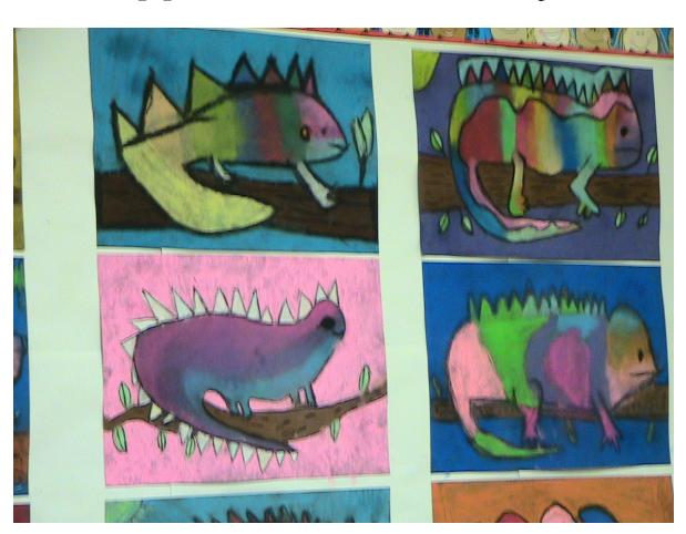
FIGURE 18. Chameleon

The idea of inspiration arose from pictures conveying artwork, such as Chameleon (Figure 18) where the explanation simply stated, "Art is inspiration. Beautiful Seeds." In this photograph, we see four visually different chameleons sitting on branches, the uniqueness of each one standing out. The idea of engagement as related to artistic expression stands out here, along with the perceived need to engage in an artistic task in order to produce beautiful art.