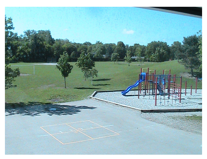
FIGURE 34. The great outdoors

One final photograph relates to outdoor spaces, but unlike the others, it offers a counter example in terms of something that might be missing. For The Great Outdoors (Figure 34), participants shared, "Kids like learning outside because you get fresh air and it's something new that you don't usually do." Sadly, the understanding conveyed here, in particular by the title of the photograph, suggests a lack of time for learning outside, along with the idea that this is something students like to do. From the viewpoint of the students themselves, the need for outdoor education opportunities is conveyed in a powerful way.