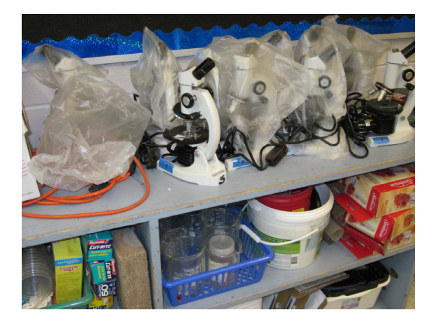
FIGURE 28. Science class