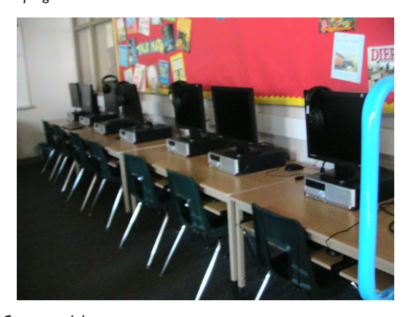
FIGURE 31. Computer lab