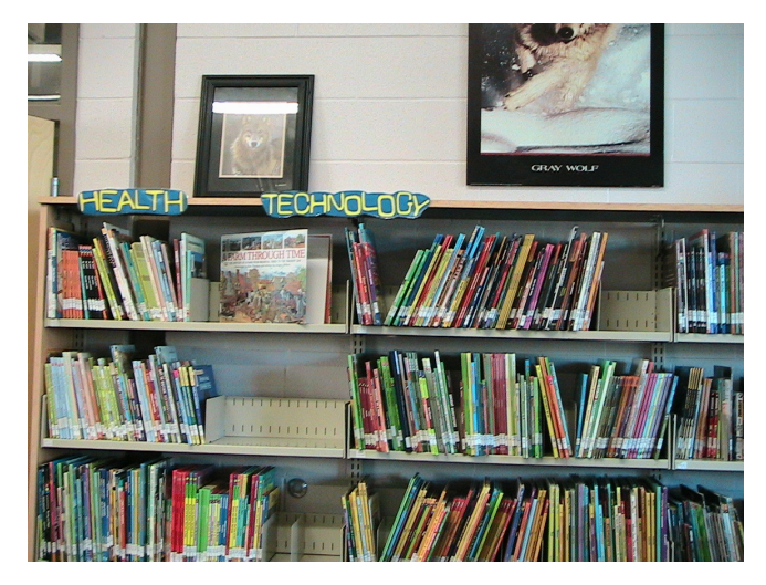
FIGURE 25. Books

This picture shows us a variety of different books that can help us learn more and discover new things. (Books, Figure 25)