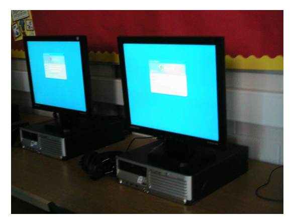
FIGURE 5. Computers