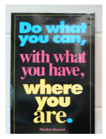
FIGURE 17. Motivational poster

The idea of inspiration arose from pictures conveying artwork, such as Chameleon (Figure 18) where the explanation simply stated, "Art is inspiration. Beautiful Seeds." In this photograph, we see four visually different chameleons sitting on branches, the uniqueness of each one standing out. The idea of engagement as related to artistic expression stands out here, along with the perceived need to engage in an artistic task in order to produce beautiful art.