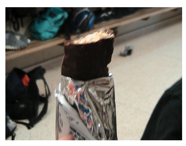
FIGURE 19. Granola bar

If you have snacks they give you good nutritional values that can keep you engaged, focused, and give you a better day. (Granola Bar, Figure 19)