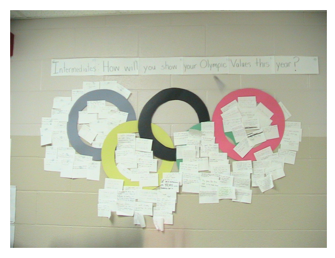
FIGURE 16. Olympic

Olympic (Figure 16) and Motivational Poster (Figure 17), on the other hand, encouraged goals related to personal accomplishments rather than academic goals. Olympic (Figure 16) displayed the students' goals for the year in connection with a camp they attended as a class. One group explained, "It shows engagement because it reminded us of our goals." Picking up on this idea of motivation to do your best, Motivational Poster (Figure 17) displayed the words "Do what you can, with what you have, where you are" by Theodore Roosevelt. The photographers elaborated, "It keep(s) you motivated and tells you to do what you can with what you have to the best of your abilities."