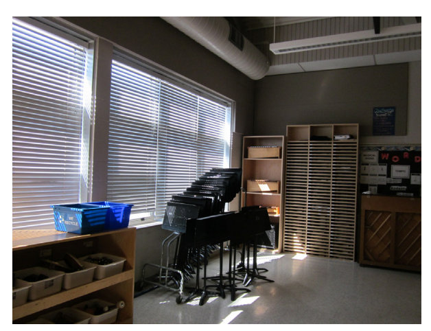
FIGURE 22. The music room

Enjoyment. Another key descriptor that emerged from the photograph rationales was that of enjoyment or fun. Interestingly, many of these images were linked to subject-specific photographs and expanded on a link between enjoyment and interest noted in the original study. For example, in the picture titled Fish (Figure 22), participants suggested, "Kids enjoy art and they are more engaged when they enjoy what they're doing." The Music Room (Figure 22) similarly conveyed a space where all were "eager to learn" due to the enjoyable nature of music itself as well as the challenge inherent in learning new instruments: "students find music enjoyable and challenging making them pay attention and therefore are more engaged."