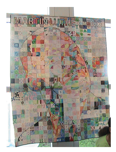
FIGURE 29. Martin Luther King