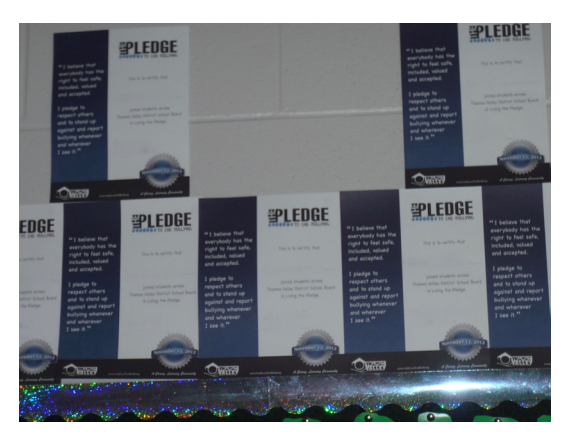
FIGURE 11. Pledge

For shared tasks, the benefit of having someone to talk to and help with learning was seen to lead to greater fun in the learning process: "If we get to work in pairs we will probably work better because we have someone to help us, and also someone to make the work more fun (to talk to)" (Working in Pairs, NI). Full Day Kindergarten Learning Area (NI) reinforced this idea: "It shows examples of young learners working together, while having fun in the process." Collaboration as part of engagement also took on a related theme of togetherness in Team Huddle (Figure 12) and Kindergarten Playground (Figure 13), where participants highlighted friendships and connections that "supported our creativity and decision-making and overall, helped us as learners." Kindergarten Playground (Figure 13), in particular, included the idea of a space that provides "opportunities to make new friends and connect with others." Perhaps reminiscent of the nostalgia these students felt as soon-to-be graduates from elementary school, this return to Kindergarten seemed to reflect spaces where the potential for engagement through collaboration first began.