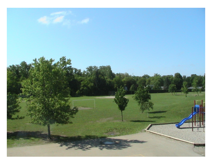
FIGURE 23. The yard

In relation to outdoor spaces, The Yard (Figure 23) and Playground Sign (Figure 24) also depicted enjoyable times, though specific to social times with friends. The Yard (Figure 23), for example, suggested that engagement was part of "enjoying times with friends," while Playground Sign (Figure 24) offered further insight into the ways this social time helped students to "be more focused on school work afterwards." The suggestion that this time leads to greater focus or engagement with schoolwork is also reminiscent of two earlier themes, that of collaboration and nourishment, both speaking to the need for breaks from structured learning in order to be able to maintain engagement throughout the school day.