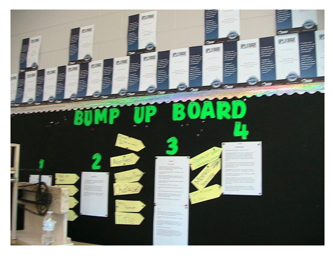
FIGURE 15. Bump up board

Olympic (Figure 16) and Motivational Poster (Figure 17), on the other hand, encouraged goals related to personal accomplishments rather than academic goals. Olympic (Figure 16) displayed the students' goals for the year in connection with a camp they attended as a class. One group explained, "It shows engagement because it reminded us of our goals." Picking up on this idea of motivation to do your best, Motivational Poster (Figure 17) displayed the words "Do what you can, with what you have, where you are" by Theodore Roosevelt. The photographers elaborated, "It keep(s) you motivated and tells you to do what you can with what you have to the best of your abilities."