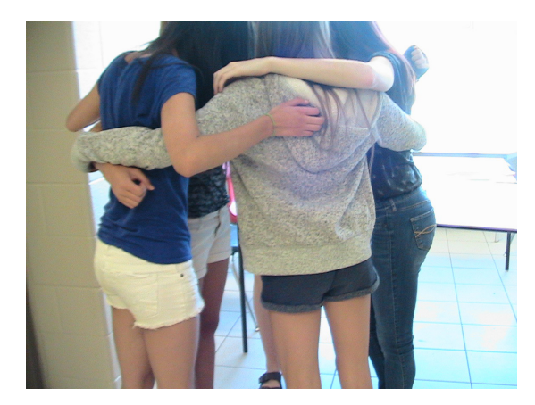
FIGURE 12. Team huddle

For shared tasks, the benefit of having someone to talk to and help with learning was seen to lead to greater fun in the learning process: "If we get to work in pairs we will probably work better because we have someone to help us, and also someone to make the work more fun (to talk to)" (Working in Pairs, NI). Full Day Kindergarten Learning Area (NI) reinforced this idea: "It shows examples of young learners working together, while having fun in the process." Collaboration as part of engagement also took on a related theme of togetherness in Team Huddle (Figure 12) and Kindergarten Playground (Figure 13), where participants highlighted friendships and connections that "supported our creativity and decision-making and overall, helped us as learners." Kindergarten Playground (Figure 13), in particular, included the idea of a space that provides "opportunities to make new friends and connect with others." Perhaps reminiscent of the nostalgia these students felt as soon-to-be graduates from elementary school, this return to Kindergarten seemed to reflect spaces where the potential for engagement through collaboration first began.