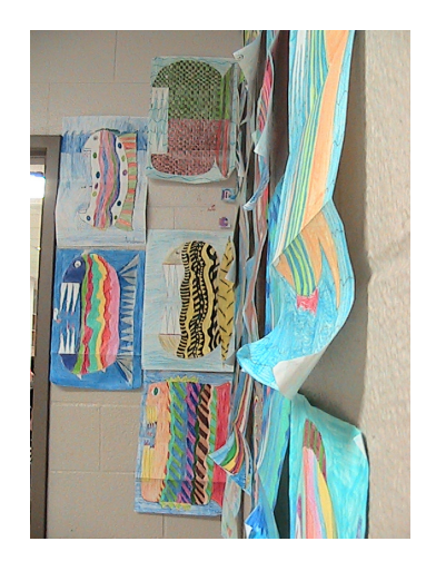
FIGURE 21. Fish

Kids enjoy art and they are more engaged when they enjoy what they're doing. (Fish, Figure 21)