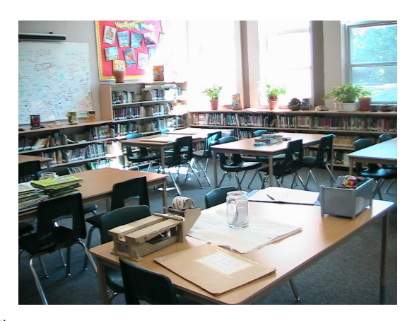
FIGURE 7. Library