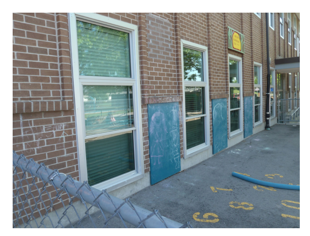
FIGURE 13. Kindergarten playground

It shows us examples of good writing that we can use to improve on and to get ideas to learn from. (Wow Wicked Words, Figure 14)