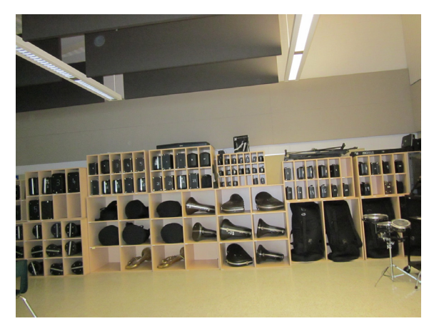
FIGURE 26. Music instruments