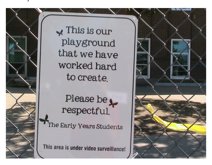
FIGURE 24. Playground sign