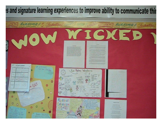
FIGURE 14. Wow wicked words

It shows us examples of good writing that we can use to improve on and to get ideas to learn from. (Wow Wicked Words, Figure 14)