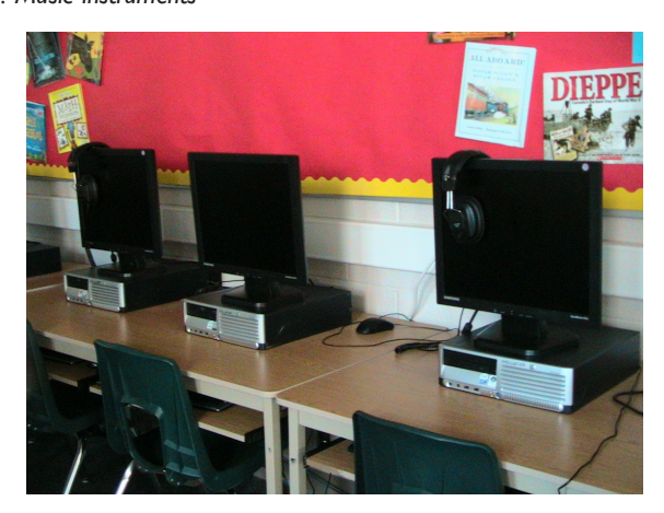
FIGURE 27. Computers