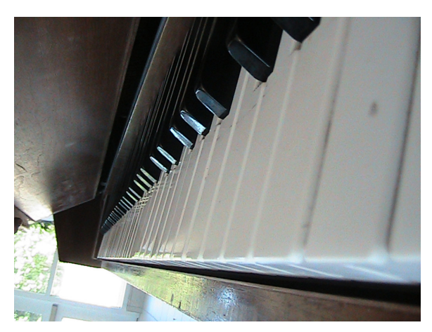
FIGURE 33. Piano keys

Interestingly, while the importance of technology was highlighted, the use of science and sports equipment, as well as musical instruments was also seen to foster this sense of discovery. For example, Music Instruments (Figure 26) focused on "learning new techniques and new notes on all of our instruments," while a picture of the door to the music room suggested it was a space that "helps us learn by making our own rhythms with instruments and exploring new things." Of course, the use of these tools to foster discovery also comes with questions of access, time spent, and priorities in education. As Music Instruments (Figure 26) illustrates, this school had access to a wide range of instruments, something not all schools are afforded, either due to lack of resources or cutbacks that affect music programs. Yet, the students' engagement and desire to learn music was evident through their comments. They viewed tools such as instruments as central to their engagement as learners. In a beautiful photograph of piano keys, one group concluded: "We are engaged in the arts which is represented by the piano keys" (Piano Keys, Figure 33).