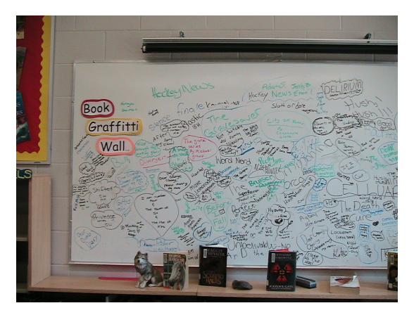
FIGURE 3. Book graffiti wall

Interest. As signified by the pictures, main areas of interest included physical education, music, library, science, and computers. Insights as to why these subjects stood out were revealed in pictures such as Book Graffiti Wall (Figure 3), which encouraged sharing of reading interests: "It shows that people are interested in reading and learning and telling others what they read." Science Experiments (Figure 4) also suggested the need for tasks that piqued interests, in particular, because it was a "great hands-on activities group work that kept our focus and interest active." The idea of active learning leading to creating engaging spaces is also revealed in pictures like Computers (Figure 5) and Gym (Figure 6), where students were provided opportunities for what they suggested was a more active involvement in learning. For example, the corresponding description for Computers (Figure 5) suggested, "the computers help us engage because it helps with active learning and teaches us whatever we need to find on the Internet." Similarly, Gym (Figure 6) conveyed the ways in which "this room allows us to be active and get involved with others."