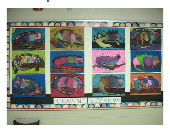
FIGURE 30. Leaping lizards