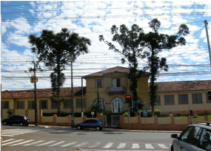
FIGURE 2. Normal school of Cambé

In Brazil, the training of elementary teachers has remained largely in the domain of normal schools (Coutinho, 1992) or at least this was the case in Cambé. Certification of teachers occurs at the municipal level in Brazil. Young people who intend to be future teachers decide on their chosen vocation by as young as 15 years old, while they are still in high school. They then apply to normal school.