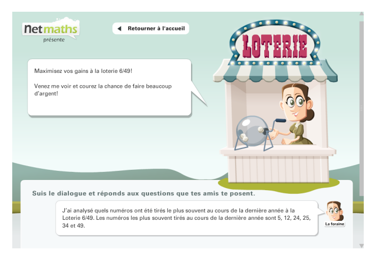
FIGURE 2. Lottery 6/49 home page

created in line with the Quebec mathematics curriculum were pertinent to the New Brunswick context, but with minor modifications. The tools could help students create links among different subject areas and also between different branches (domains) in mathematics. The teachers' concerns were mainly related to the use of the virtual tools in supporting students to develop their mathematical competencies and about the cross-curricular competencies – both envisioned by the provincial curriculum. Beyond the learning outcomes specific to the mathematics curriculum, teachers said that the simulators could help students develop their critical thinking toward games of chance and gambling, which according to them, is an important aspect of cross-curricular learning. The resources concerning virtual simulations enabled students to gain a sense of probability scenarios without engaging in actual gambling. Figure 2 presents the Lottery 6/49 home page, where students were asked to play and test some ideas.